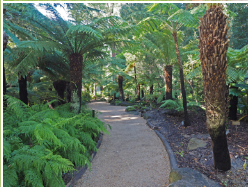
Top: Perennial Border, Below: Fernery.

The Perennial Border displays a wide range of plants that flower in Summer and early Autumn. Come and enjoy the diversity of colours, sizes and leaf textures.