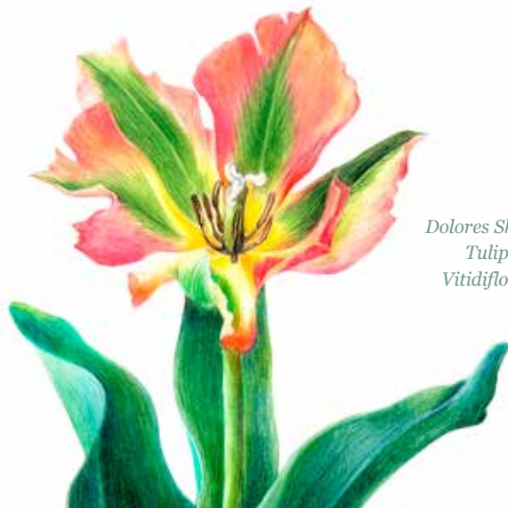
Dolores Sk-Malloni Tulipa "Artist" Vitidiflora Group

flowers is transient – once a specimen is selected it must be analyzed and sketched, then translated onto paper for completion. In between collection and recording the original flower may have wilted, its life cycle finished. The artists will often wait a full year before they can again work directly from a freshly picked specimen.