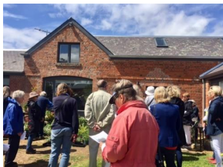
Through the Garden Gates 2016