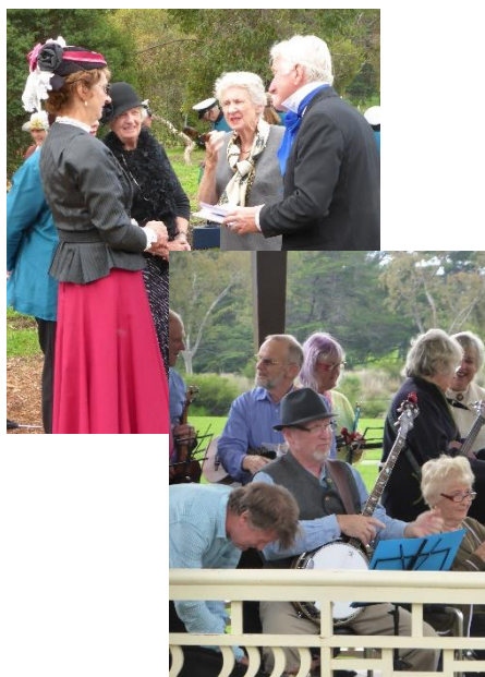
'Echoes of the Past' re-opening of the Ladies Kiosk