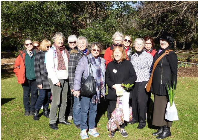
Members of FGBG during the visit to RBG, Melbourne