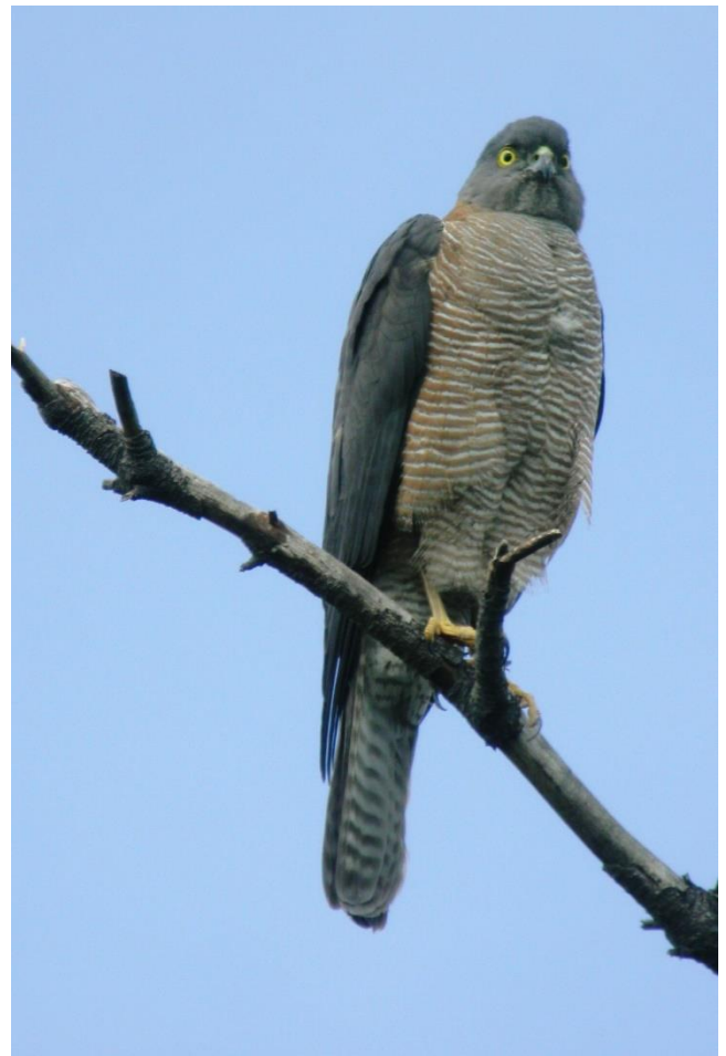
Collared Sparrowhawk, adult female in Eastern Park, October 2004