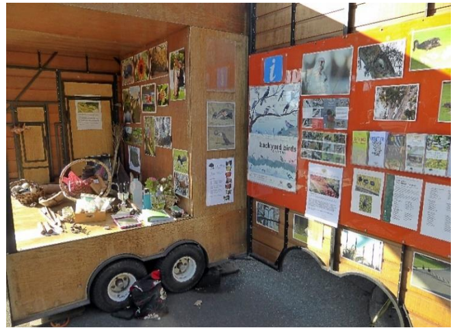
The Pod at Royal Botanic Gardens, Melbourne

First, a coffee break at the café was followed by a walk to the Friends' nursery where their co-ordinator met us and informed us about the procedure all plants needed to follow before they were allowed to be sold. It was interesting to find out that only the official gardeners were allowed to take cuttings from the gardens for propagation and stringent weed control was implemented before sale. They specialised in Vireya plants with a system of labels which highlighted the natives. Most plants were at ground level with some under cover in the shade house. There were many small constructions for various plants which were at risk from possums and other predators; a truly interesting experience with a small contingent having discussions regarding management etc.