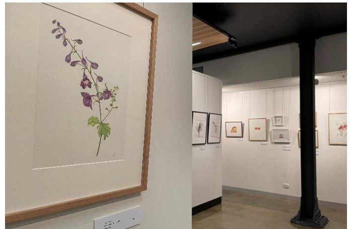
Beautiful artwork around every corner of the Gallery