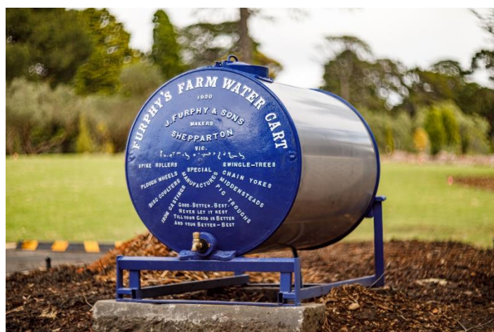
The Furphy Cart after restoration

In 2018 a very large bequest was received into the Gift Fund. Due to a request from the estate, currently over half of the Gift Fund has been committed to a major project, to be determined by the anticipated new GBG Master Plan. The balance of the Gift Fund is generally used for non-major GBG projects