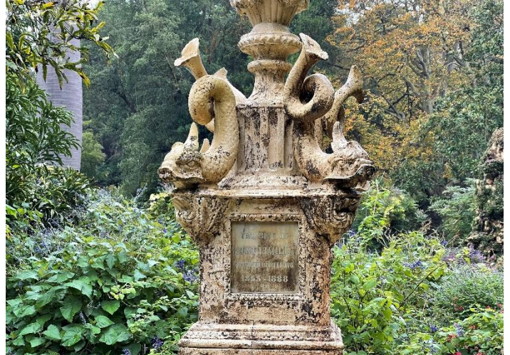
The Traill Fountain, showing some of the beautiful sculptures that adorn the structure

You may have noticed that the Friends are working with the Geelong Botanic Gardens to have all the significant heritage structures restored over time. This has been made possible by using the Gift Fund. In the past 18 months, the Hitchcock Fountain, the three urns and the Hansen Gates have been restored. However, there is still one significant item in need of attention: the Traill Fountain.