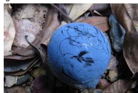
Ripe Fruit.

The full article and location map is on the website