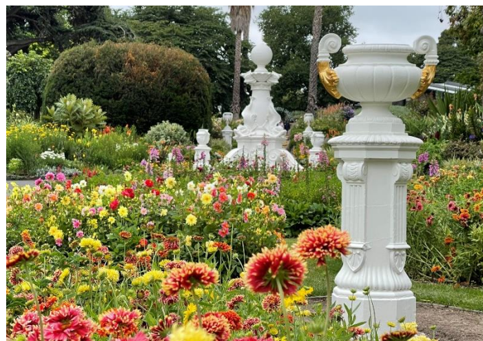
The Hitchcock Fountain and surrounding urns after restoration

In reading through the list, every member who has worked for or supported the Friends, and members and the public who have contributed through donations, should feel great pride in their contribution, no matter how big or small. Collectively, we have supported the on-going development of this truly magnificent botanic garden. In carrying out our primary purpose, "To conserve, protect and enhance the Geelong Botanic Gardens and its environs, including Eastern Park", it is fitting this year to acknowledge, with great satisfaction, the Friends' outstanding financial contribution to Geelong Botanic Gardens.