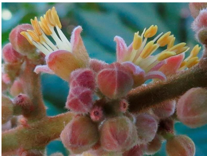
Davidsonia pruriens Cairns Queensland

Davidsonia is an understory plant of the rainforest. The trees have several forms ranging from single trunked with a few branches and large compound leaves which grow from the top part of the trunk, to multi-trunk forms covered in dense foliage to the ground. The reddish-brown flowers occur in pendulous clusters in spring. These are followed by purple, edible fruits up to 50mm diameter which resemble small plums. In the wild, the seeds of the Davidson Plum need to pass through the gut of animals to germinate. The tree kangaroo chews the plump, juicy fruit first, but the cassowary can swallow it whole. Digestion can take hours to days, during which time the animals may have wandered kilometres from the parent tree. The broken-down fruit and seeds are excreted by the animal, giving germination a kick start of fertiliser, resulting in a successful seed spread.