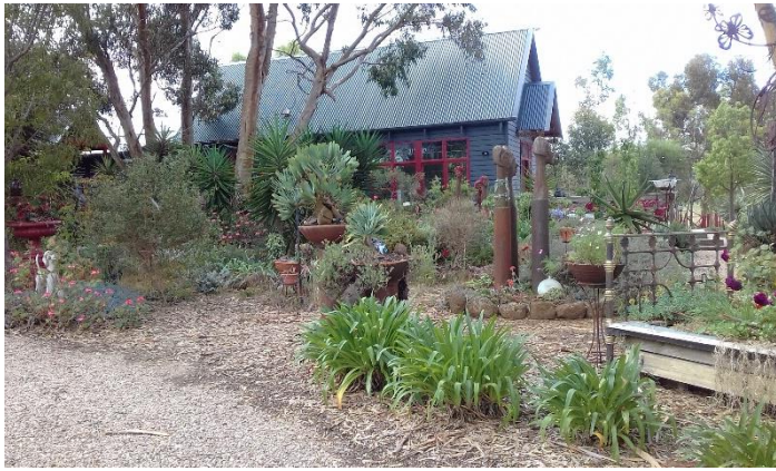
Amazing Sculptures in ArtRocks Garden