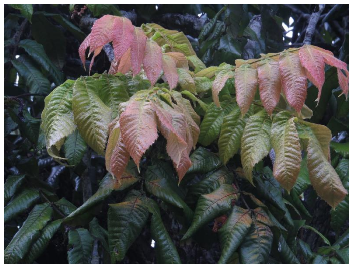
Davidsonia pruriens new leaves

It seems to me that the trees we have in our Gardens are probably D. jerseyana , as they are not covered with itchy hairs, the fruit is smooth and does not come from long pannicles. Our fruit produces seed which germinate readily, so it is certainly not D. johnsonii . Somewhat confusing!