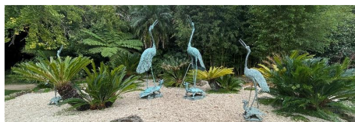
The Japanese Cranes and Dragon Tortoise statues

Since the Friends were formed in 1985, the financial contribution of the Friends to Geelong Botanic Gardens has been significant. A list of achievements has been maintained over several years and has recently been updated.