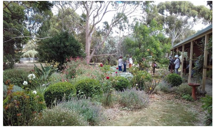
Friends enjoying the home gardens at the Wildflower Farm