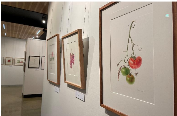
Inspired by Nature 7 Botanic Art Exhibition