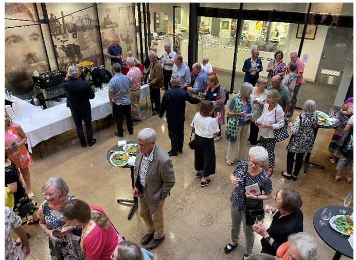
A view from above: some of the 100 guests that filled the atrium next to the gallery space