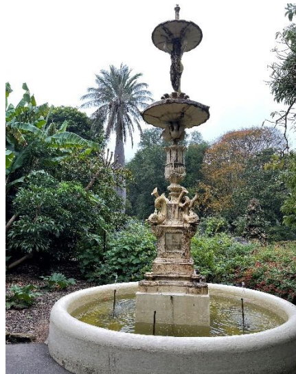
The Traill Fountain, from top to bottom

Where possible, our policy is to apply for a grant so that the Gift Fund is not drained of funds. In March we applied to Heritage Victoria for a grant to restore the Traill Fountain. Heritage Victoria have generously assisted us in this process as it is quite complex. We await the outcome.